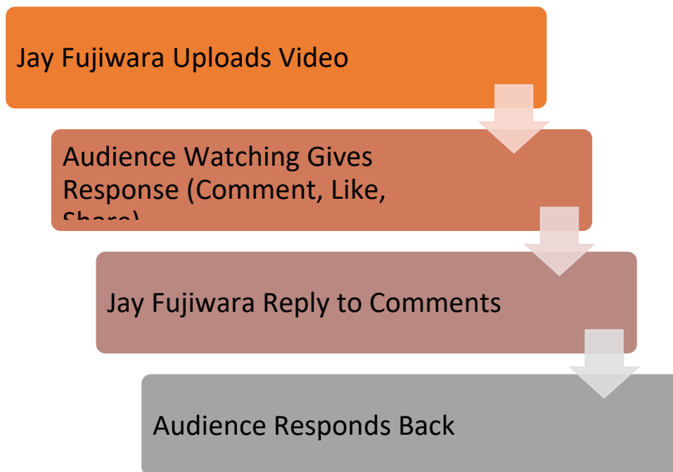
Picture 1. Flowchart of TikTok Account Interaction @jayfujiwara as English Learning Media

Jay Fujiwara builds credibility as a learning resource with a friendly, professional, and relatable communication style. This credibility is important in the context of online learning, where trust is the main key.